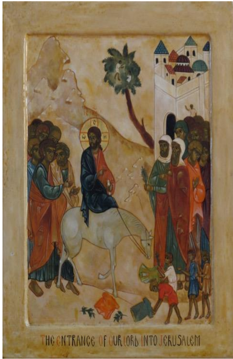
THE ENTRANCE OF OUR LORD INTO JERUSALEM